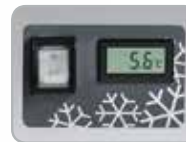
TC ICE Controls