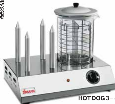
HOT DOG 3 - 4