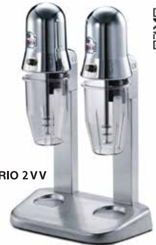
SIRIO 2 VV