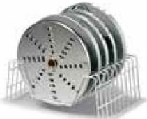
EQUIPED WITH 5 DISCS