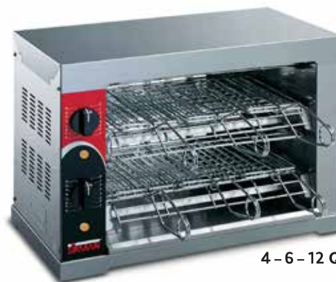
4 - 6 - 12 Q