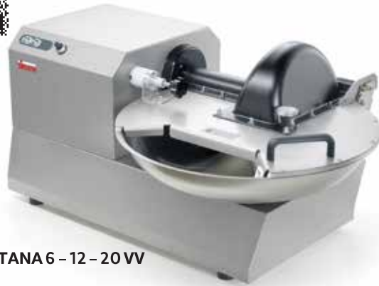
KATANA 6 - 12 - 20 VV