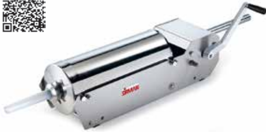
MANUAL SAUSAGE STUFFERS IS 8 - 16 ARIES