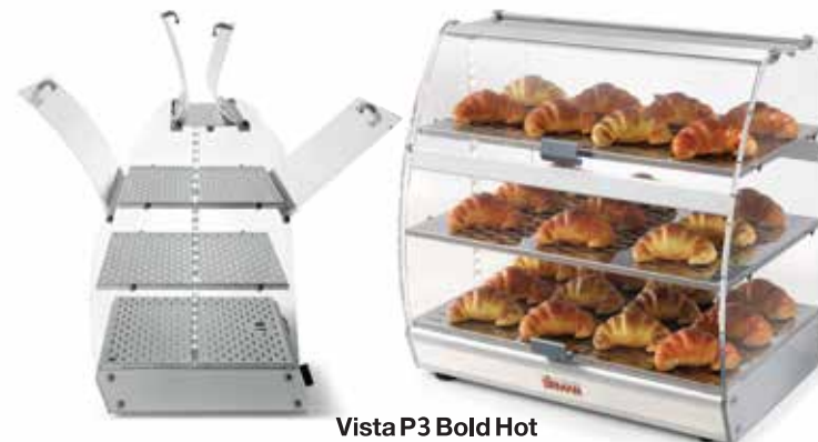
Vista P3 Bold Hot