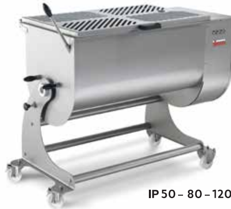
IP 50 - 80 - 120 - 180 BA