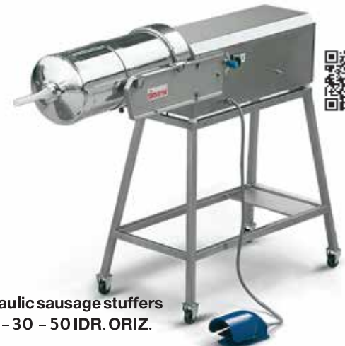
hydraulic sausage stuffers IS 16 - 30 - 50 IDR. ORIZ.