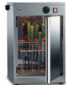
STER. UV 16 - 24W