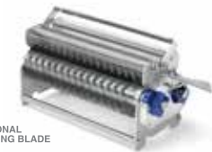
OPTIONAL CUTTING BLADE