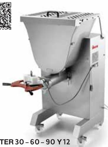
MASTER 30 - 60 - 90 Y12