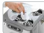
Compartment For Knives And Plates