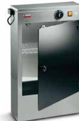
STER. UV NAPOLI