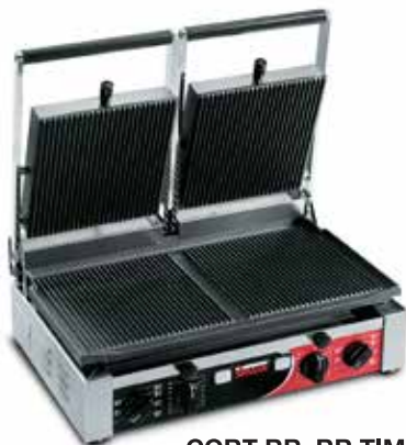
CORT RR-RR TIMER