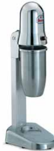
SIRIO 1 VV