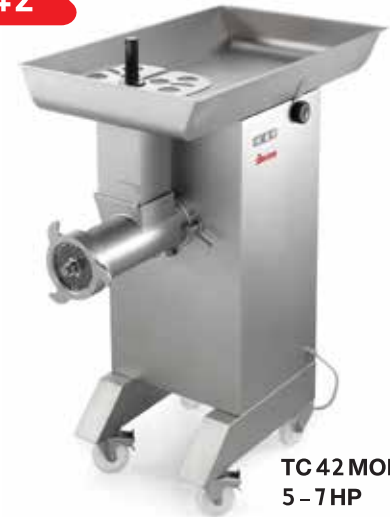
TC 42 MONTANA Y12 5 - 7 HP