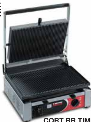
CORT RR TIMER