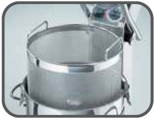
VEGETABLE DRYER BASKET