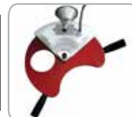
SEMI-AUTOMATIC FOR MONTANA - MASTER ROUND FIXED MOULD Ø 100 MM