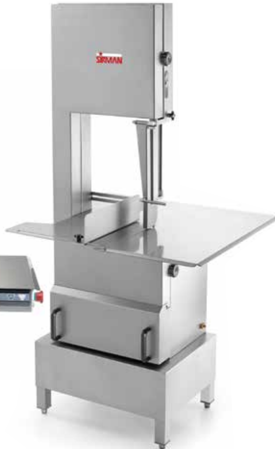
SO 1650 - 2020 - 2400 - 3100 INOX