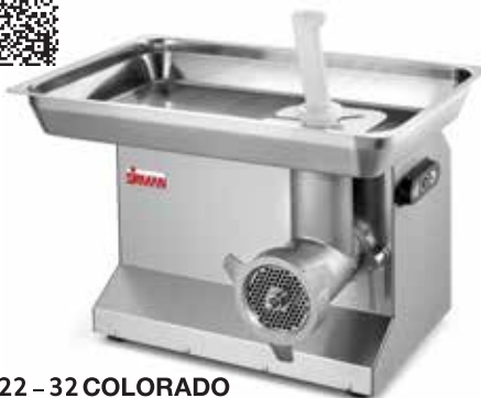
TC 22 - 32 COLORADO