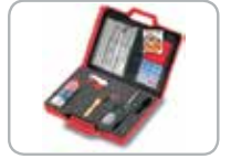
SMALL SUITCASE WITH MAINTENANCE KIT STANDARD ON TOP VERSIONS