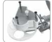
AUTOMATIC FOR MONTANA - MASTER