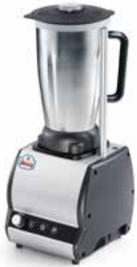
ORIONE T VV