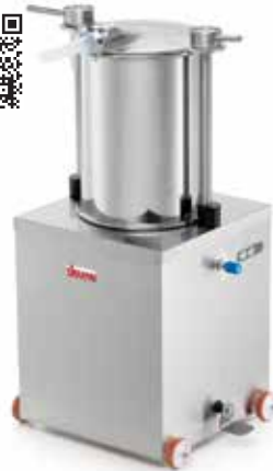
VERTICAL HYDRAULIC SAUSAGE STUFFERS IS 15 - 25 - 35 - 50 IDRA