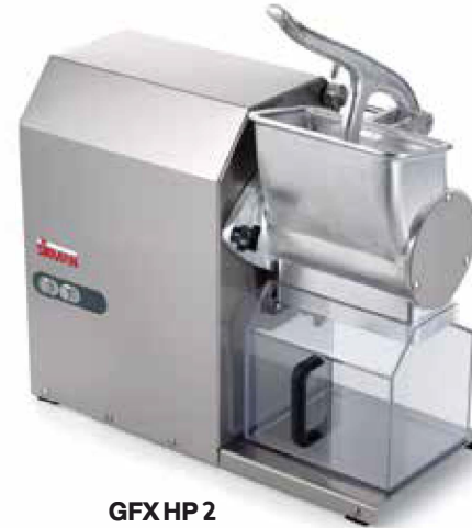
GFX HP 2