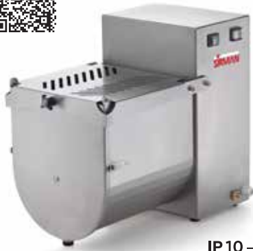
IP 10 - 20 M