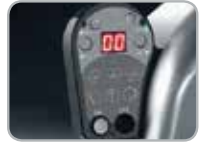
PALLADIO AUT CONTROLS