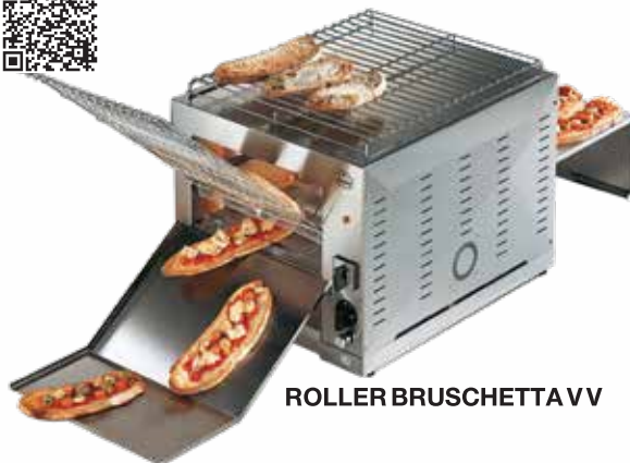
ROLLER BRUSCHETTA VV