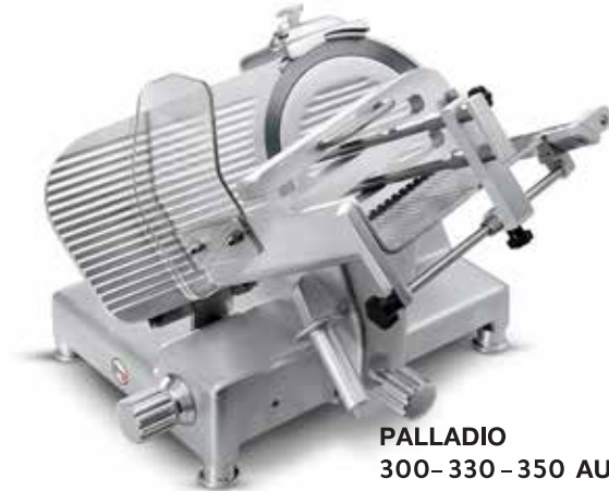
PALLADIO 300-330-350 AUT.