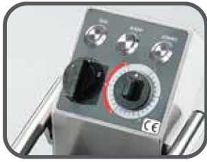
PPJ 2VS/STEEL IP 67 CONTROLS