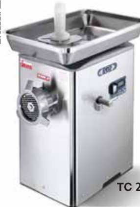
TC 22 - 32 BARCELONA ICE