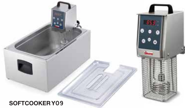
SOFTCOOKER Y09 1/1GN - 2/1GN