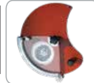
FOR COLORADO - BARCELONA ICE