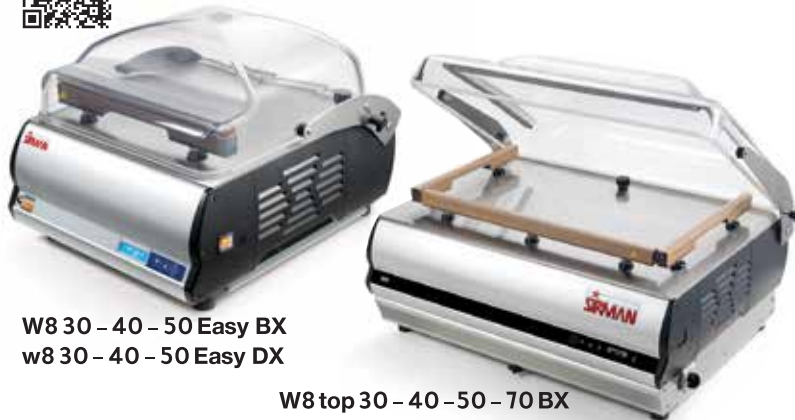
W8 30 - 40 - 50 Easy BX w8 30 - 40 - 50 Easy DX