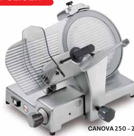
CANOVA 250 - 275 - 300