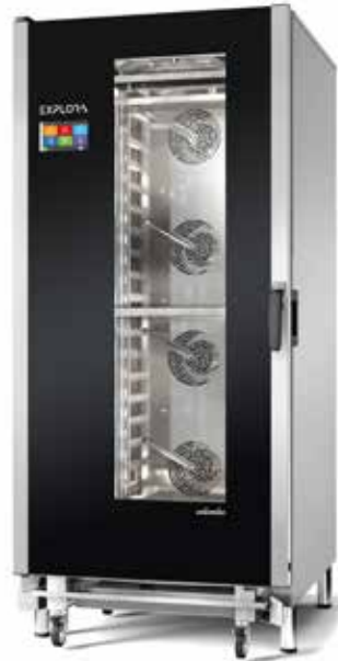
EXPLORA PF7916 16 TRAY