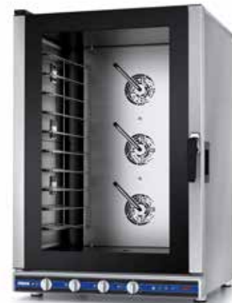
GALILEI PF7710 10 TRAY