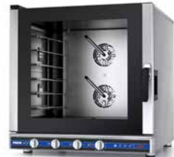
GALILEI PF7706 6 TRAY