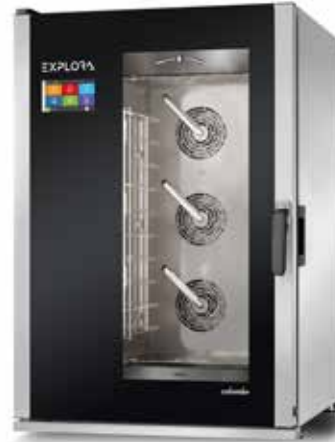
EXPLORA PF7910 10 TRAY