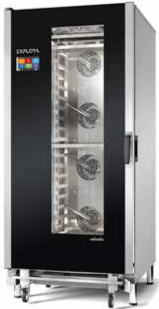
EXPLORA PF7920 20 TRAY