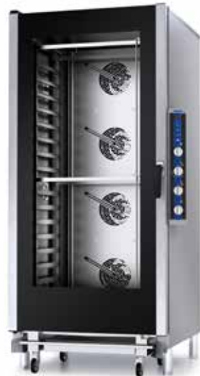
GALILEI PF7716 16 TRAY