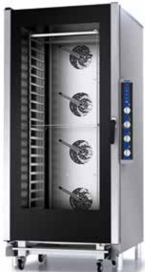
GALILEI PF7720 20 TRAY