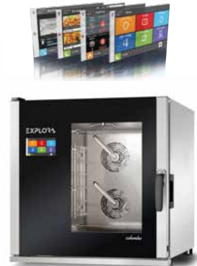
EXPLORA PF7906 6 TRAY