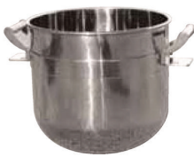
Fine wire whisk · Fouet